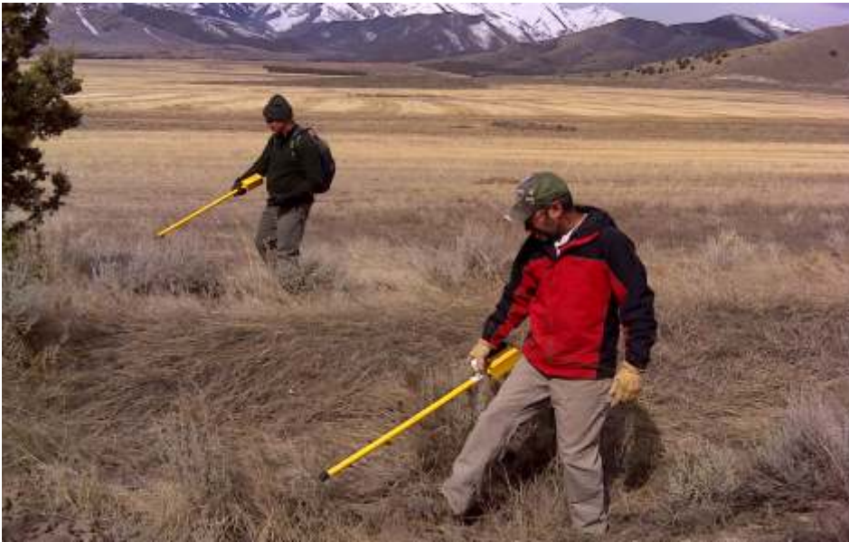
Contractors use hand-held magnetometers to detect metal anomalies. These instruments will be used during the investigations taking place this spring.

From a distance, one might think a group of people scanning the ground with metal detectors is searching for buried treasure. But this is no ordinary group of people. Yes, they are searching for something, but not buried treasure. They are looking for munitions--specifically, munitions from previous military training activities that took place many years ago at and around Camp Williams.