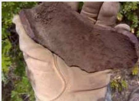
An artillery fragment discovered at Wood Hollow. This anomaly was dug up to ensure it was not hazardous.