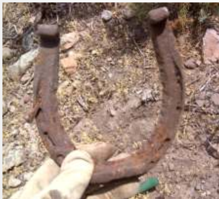
Civilian debris found at Wood Hollow. This anomaly was dug up to ensure it was not hazardous.

A few of the anomalies excavated during the recent field work turned out to be cultural debris such as cans, horseshoes, and wire. The majority of the anomalies were MD consisting of artillery fragments and pieces. The MD was collected and removed from the sites. A small number of anomalies were MEC, and these items were either detonated in place or removed to ensure they did not present a hazard to human health or the environment.