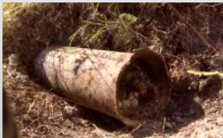
A 75mm shrapnel round discovered at Wood Hollow. This round had lead balls intact and was detonated in place to eliminate the hazard.