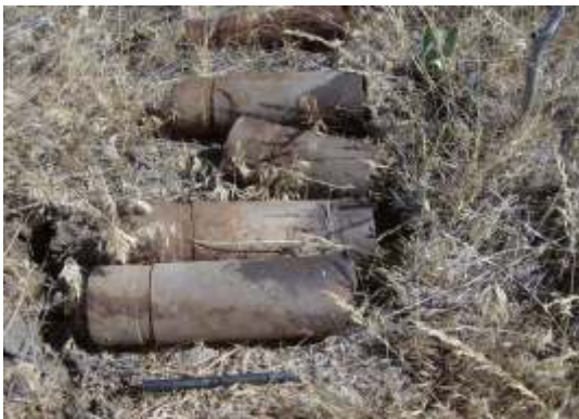
Photograph showing 75mm French Artillery Rounds discovered in the Wood Hollow Training Area.